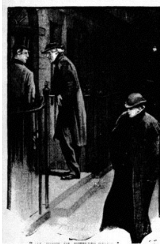
Figure. 4. The Youth, pen, ink, and wash from Arthur Conan Doyle, The Original Illustrated Sherlock Holmes (Secaucus, NJ: Castle Books, 1979; 23). (^)