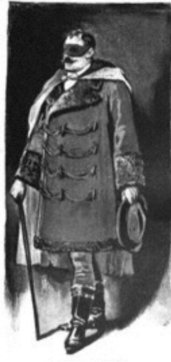
Figure. 1. The King of Bohemia, pen, ink, and wash from Arthur Conan Doyle, The Original Illustrated Sherlock Holmes (Secaucus, NJ: Castle Books, 1979; 14).(^)